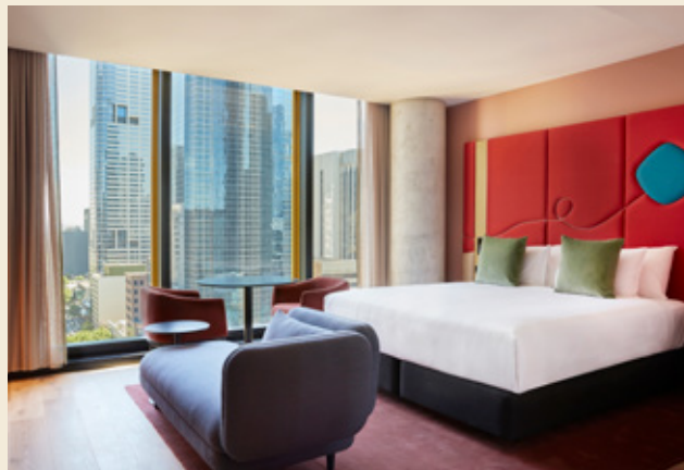
Hosier Club Room