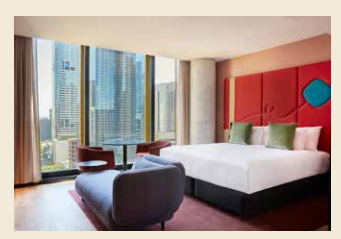
Hosier Club Room