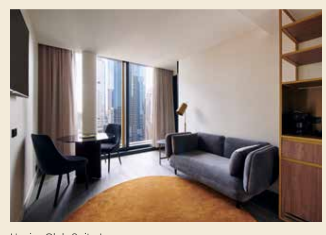
Hosier Club Suite Lounge