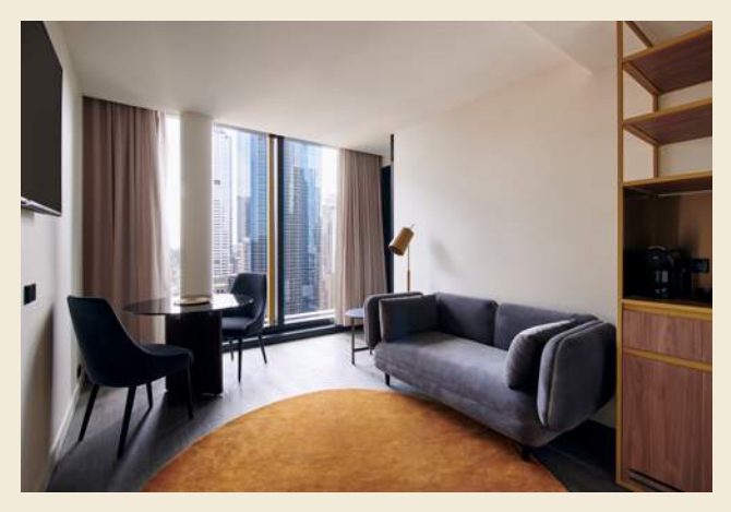
Hosier Club Suite Lounge