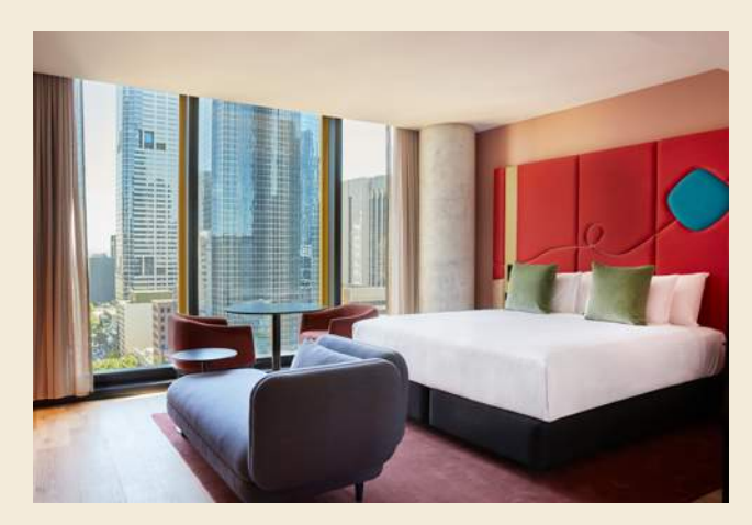
Hosier Club Room