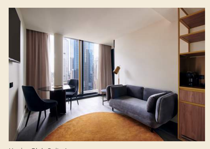
Hosier Club Suite Lounge