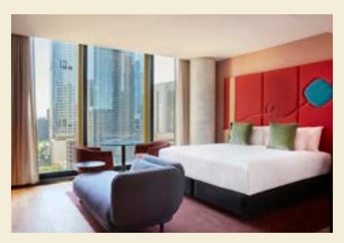
Hosier Club Room