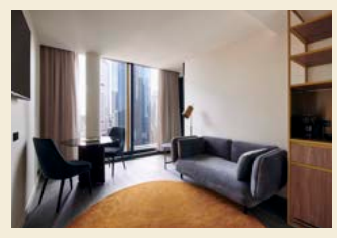
Hosier Club Suite Lounge